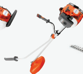
BRUSHCUTTERS & CLEARING SAWS